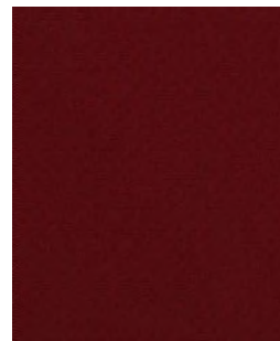
Moonscape Stretch Fabric Ruby