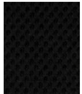
Spacer Mesh Fabric Black