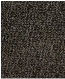
Moonscape Stretch Fabric Ebony

Additional options are available through your Sales Representative.