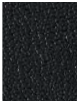
Boltaflex Colorguard Vinyl Black