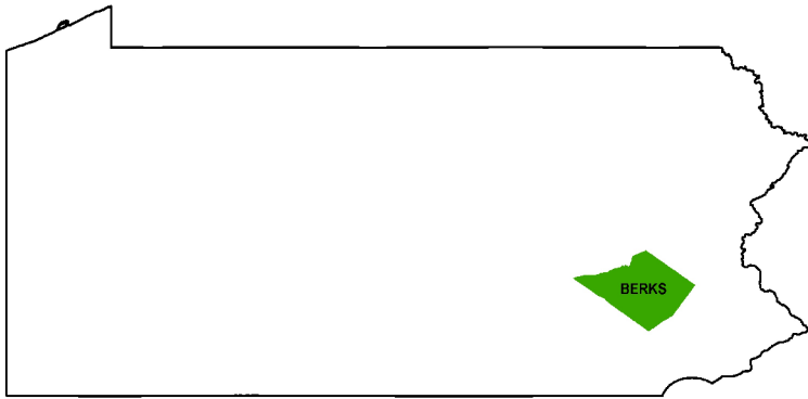
Workforce Development Area (WDA) Unemployment, Jan 2014 to Sep 2024