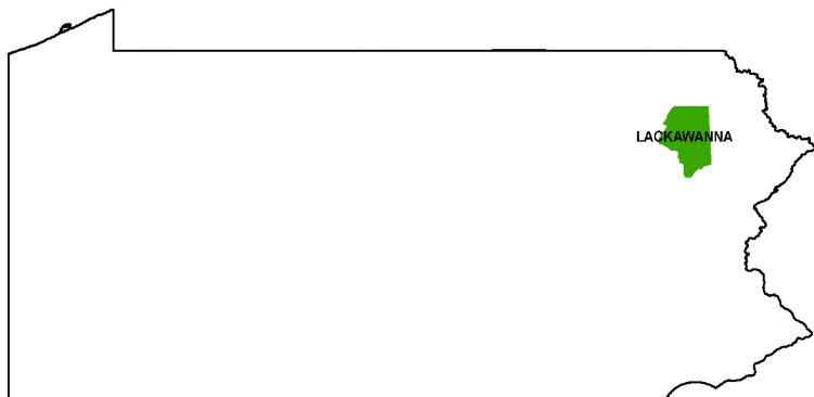
Workforce Development Area (WDA) Unemployment, Jan 2014 to Sep 2024