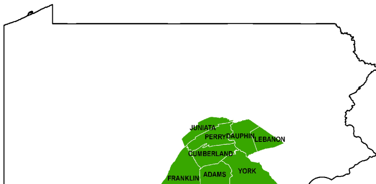
Workforce Development Area (WDA) Unemployment, Jan 2014 to Sep 2024