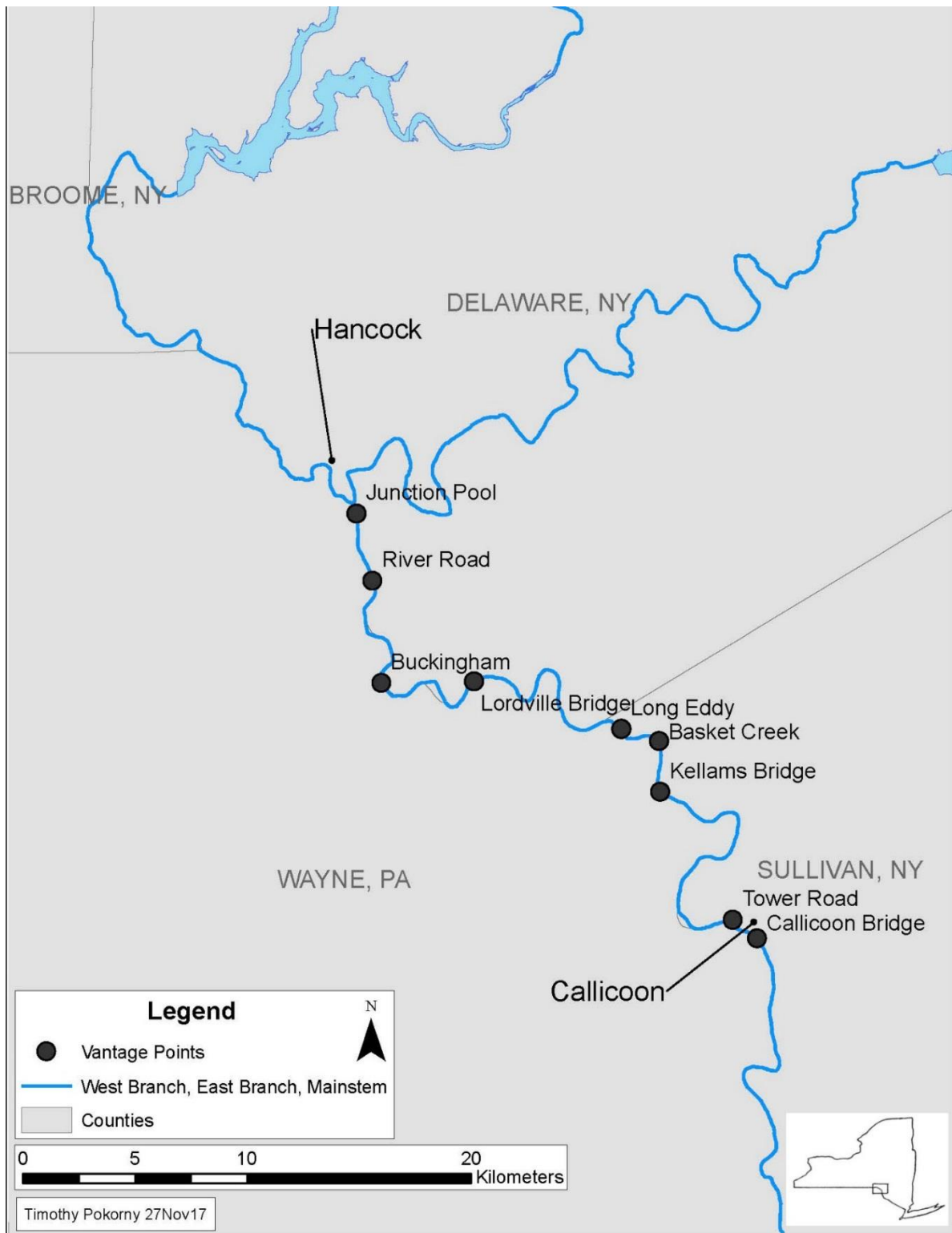
Figure 2. Map illustrating count vantage points in the Delaware River census reaches.