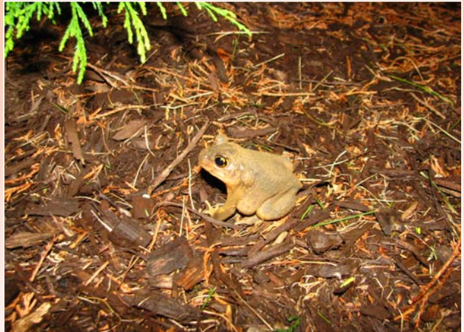
Eastern Spadefoot toad in garden of project volunteer.

Volunteers: This effort has effectively mobilized a support team of field-based, citizen scientists throughout the Commonwealth. Nearly two dozen volunteers donate 3,000-4,000 hours annually to this project. Project volunteers conduct field studies, collect important observational data, and have helped to inform numerous landowners and other interested parties about the Eastern spadefoot and the