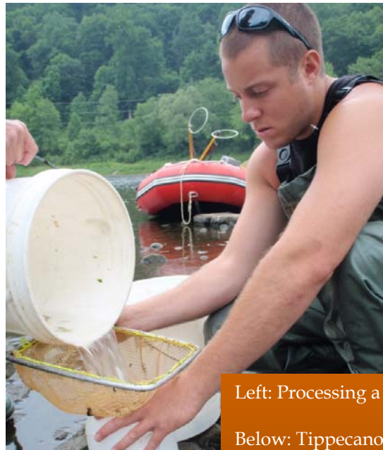
Left: Processing a fish sample.

that this free flowing reach of the Allegheny River appears to harbor some of this state's most imperiled fishes.