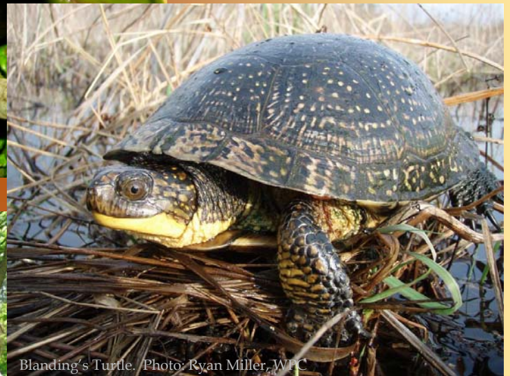
Blanding's Turtle.