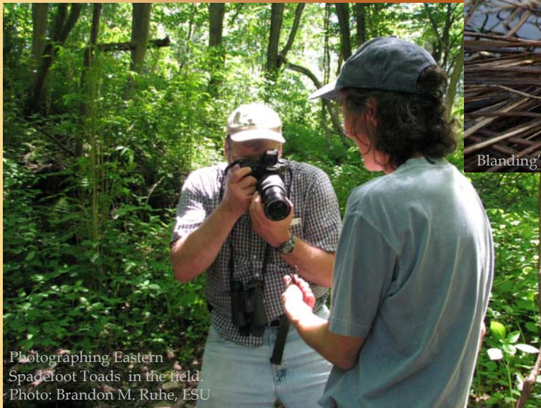
Photographing Eastern Spadefoot Toads in the field.