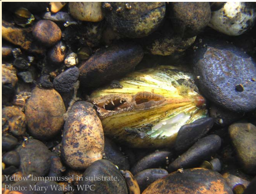
Yellow lampmussel in substrate.

developed. The results of this project will be added to our mussel studies in the other the major sub-basins of the Susquehanna River in Pennsylvania. We anticipate that more informed management of Pennsylvania's mussels will occur as a result of this project, particularly the conservation of mussel habitats.