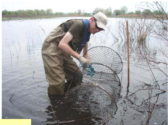
Setting a trap net (upper). Blanding's Turtle (lower).

June, 2009-2010, resulted in a total of 131,448 total trap-hours at fourteen locations in Erie and Crawford Counties resulting in the capture of four (4) Blanding's turtles in Erie County at one location. We collected habitat data, turtle weight, sex and assessed their overall health. All of this information will be useful for assessing the status of the remaining population of Blanding's turtles. Further study (i.e. radio telemetry, DNA analysis) of the remaining population is needed to determine if the last population of Blanding's turtles in Pennsylvania is still viable.