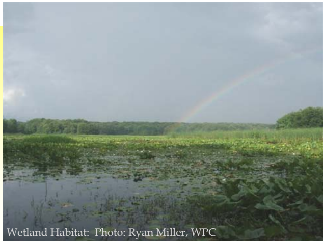
Wetland Habitat: Photo: Ryan Miller, WPC

The State Wildlife Grants Program (SWG) represents an investment in the natural resources of Pennsylvania, and practical, tangible benefits of the program are new data and an increased understanding of the Commonwealth's species of greatest conservation need (SGCN), enhanced protection & management, and knowledge of their habitats. These data are laying the foundation for current and future conservation actions and will be especially important for addressing potentially deleterious factors such as climate