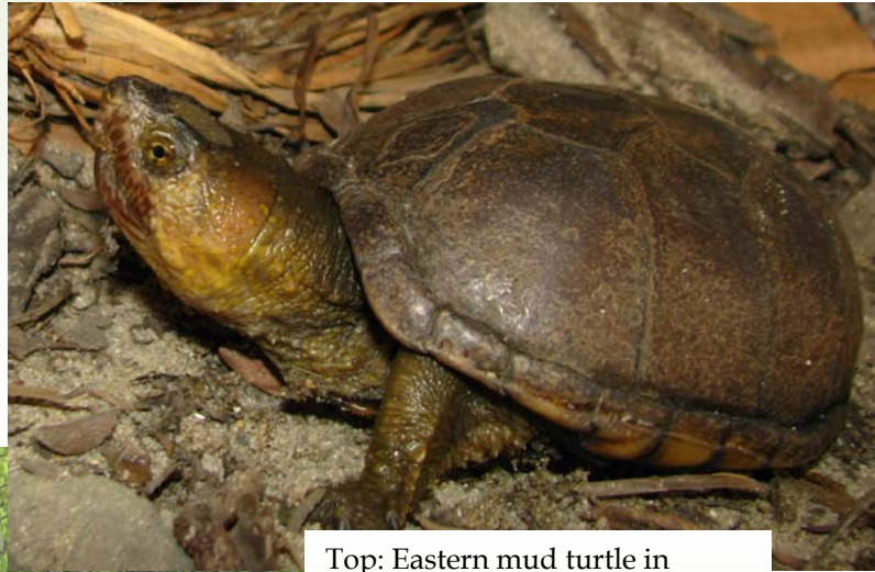
Top: Eastern mud turtle in Pennsylvania.

Pennsylvania for the first time since 1963. While no longer considered extirpated as a result of this project, the Eastern mud turtle is one of Pennsylvania's rarest species of turtle. The results of this study have shown that occupied Eastern mud turtle sites are very diverse habitats that harbor numerous plants and animals considered rare in Pennsylvania. Efforts are underway to work with landowners and the PFBC to provide the highest degree of