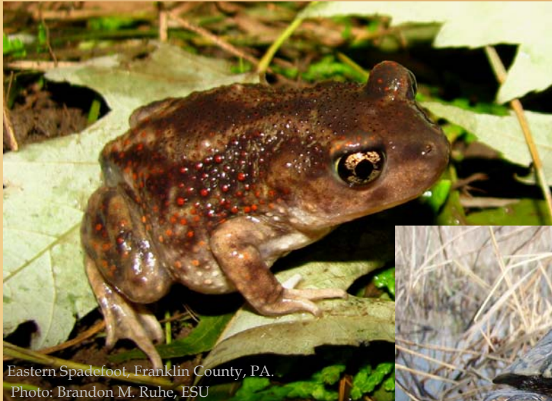
Eastern Spadefoot, Franklin County, PA.