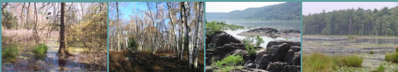
Examples of Pennsylvania Habitats: L-R: Vernal Pool Michaux State Forest, Forest @ Brooks Natural Area, Susquehanna River @ Vinegar Ferry, Wetland @ Mink Pond

Pennsylvania's role in regional conservation. Strategies and priorities identified in 2015 Pennsylvania Wildlife Action Plan have been developed recognizing this regional context and the Commonwealth's important role in protecting imperiled and declining species. Pennsylvania's habitats are the foundation of the states' natural heritage and crucial to leaving a legacy for future generations.