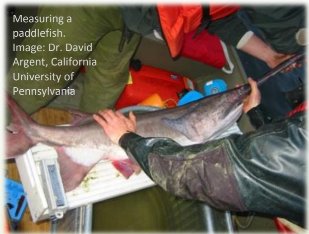
Measuring a paddlefish.