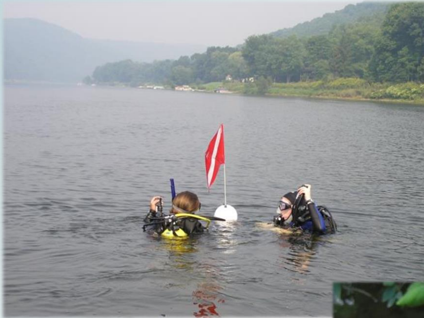
Divers in the Allegheny River (left); Pistol grip ( Quadrula verrucosa ), a large-river mussel (below).