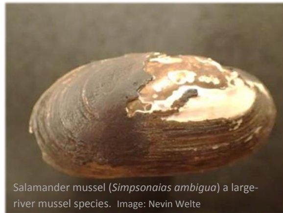
Salamander mussel ( Simpsonaias ambigua) a large-river mussel species.

Project: F15AF00413. Assessment of Freshwater Mussels in the Ohio River Watershed in Pennsylvania. Western Pennsylvania Conservancy.