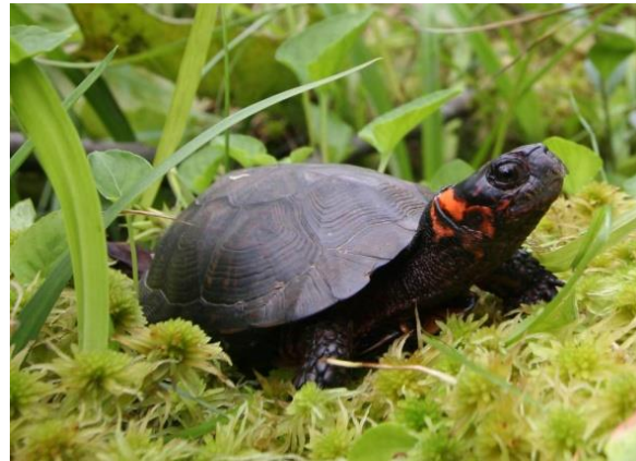
Figure 1. Bog Turtle ( Glyptemys muhlenbergii ).

Taxonomy: Class Reptilia, Order Testudines (turtles), Family Emydidae (water turtles), Bog Turtle ( Glyptemys muhlenbergii )