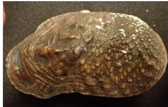
Figure 1. Pistolgrip ( Tritogonia verrucosa ) (CM 61.3577, Mahoning River, Edinburg, PA, collected by A.E. Ortmann, 1908)

with a distinct, elevated, and rounded posterior ridge. Shells of old males may reach a length of 160 mm, while those of females may reach 120 mm." The shell is covered in tubercles and is distinctly differentiated from similar-looking Pennsylvania species by its dark periostracum, sculpturing, and shape.