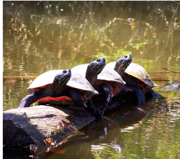
Figure 1. Northern Red-bellied Cooters ( Pseudemys rubriventris ).

Description: The Red-bellied Cooter is a large aquatic turtle distinguished by a deep notch at the tip of the upper jaw with a prominent cusp on either side. Coloration