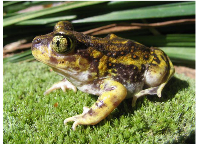
Figure 1. Eastern Spadefoot ( Scaphiopus holbrookii ).

Taxonomy: Class Amphibia, Order Anura (frogs and toads), Family Pelobatidae (spadefoots), Eastern Spadefoot ( Scaphiopus holbrookii , Harlan 1835)