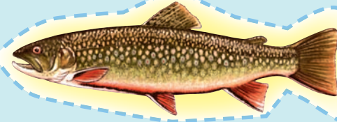
Adult Brook Trout