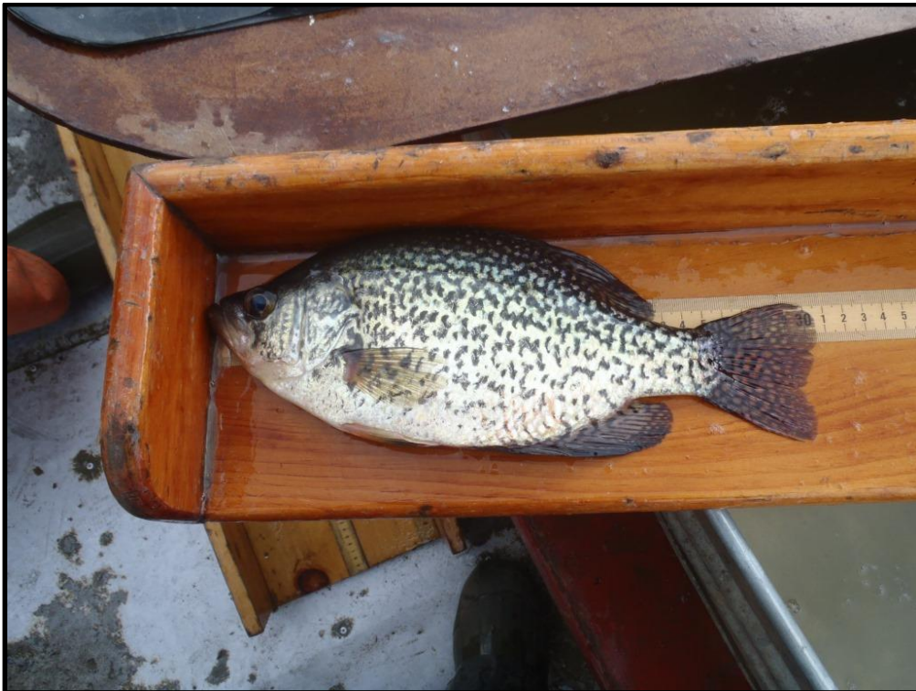
An abundance of Black Crappie were sampled in our trap nets at Edinboro Lake.

Edinboro Lake receives annual plantings of Walleye fingerlings to maintain the lake's Walleye fishery. During our sampling efforts a total of seven adults were captured. This was low but not surprising given the timing of our survey. Water temperatures were generally too warm to effectively sample Walleye