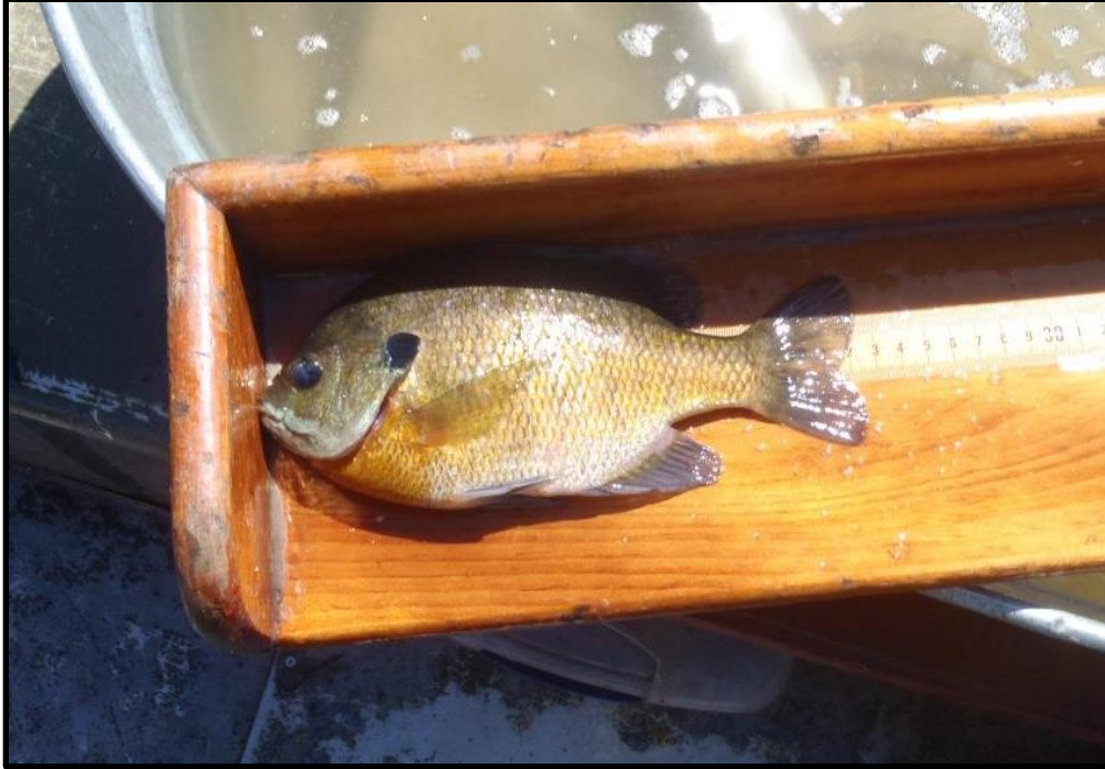
A quality size Bluegill caught in our trap nets at Edinboro Lake.