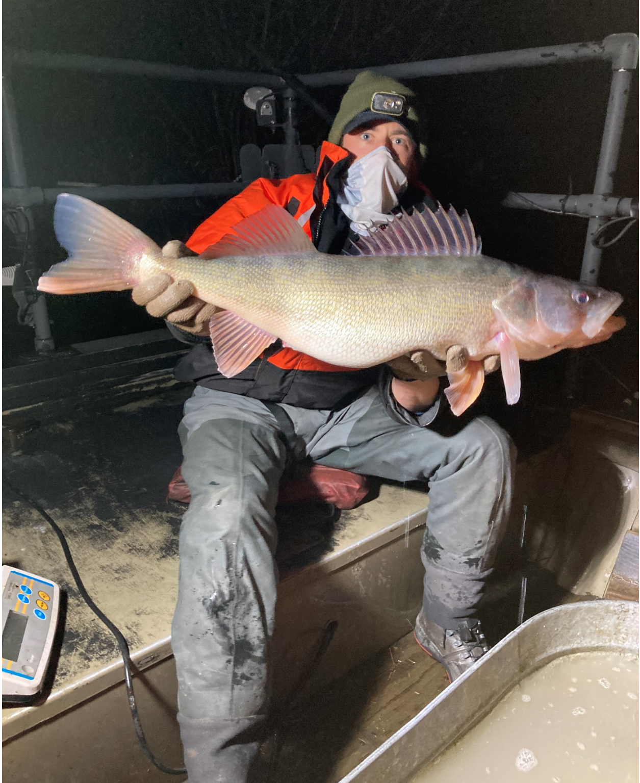
A 28-inch 11.8-pound Walleye captured on March 31, 2021 from Cowanesque Lake.