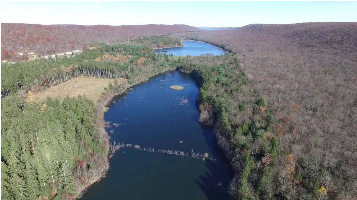
Aerial photo of Owl Creek Reservoirs, Schuylkill County. Lower Reservoir in foreground.

Upper Owl Creek Reservoir and Lower Owl Creek Reservoir are 67-acre and 26-acre impoundments, respectively, created by two adjacent dams on Owl Creek, a tributary to the Little Schuylkill River, located south of Tamaqua Borough, Schuylkill County. Formerly part of Tamaqua Borough's ( www.tamaqua.net ) drinking water supply, Upper Owl Creek Reservoir was opened to fishing in 2002 after the Borough decided to allow low-impact recreation. At that time, the lower reservoir had been drained and was dry with the reservoir bottom characterized by a thicket of shrubs among numerous natural boulders.