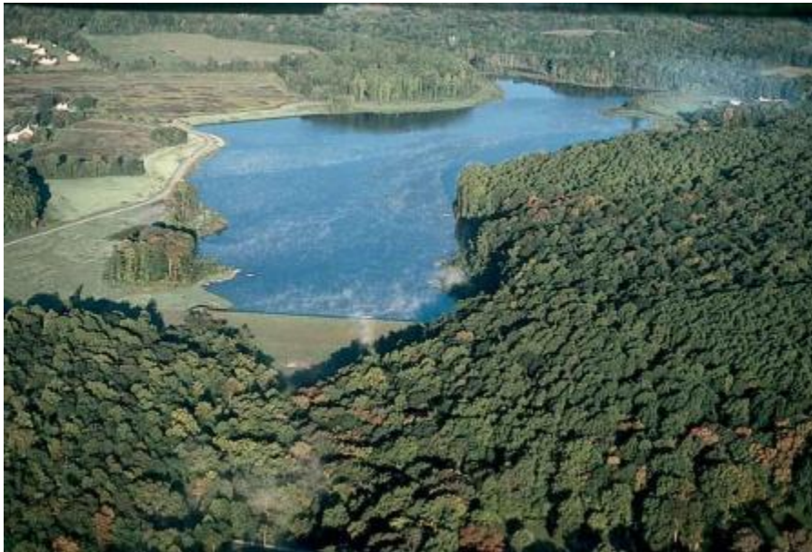
Aerial photo of Chambers Lake, Chester County

Chambers Lake is an 89 acre reservoir created in 1994 by the impoundment of Birch Run in Hibernia County Park, Chester County. Chambers Lake was opened to fishing in 1999 after preliminary stockings and subsequent evaluation of a quality sport fishery. This highly productive reservoir has an average depth of 14 feet with maximum depth reaching 38 feet. The Chester County Water Resources Authority and the City of Coatesville are joint owners of the dam.