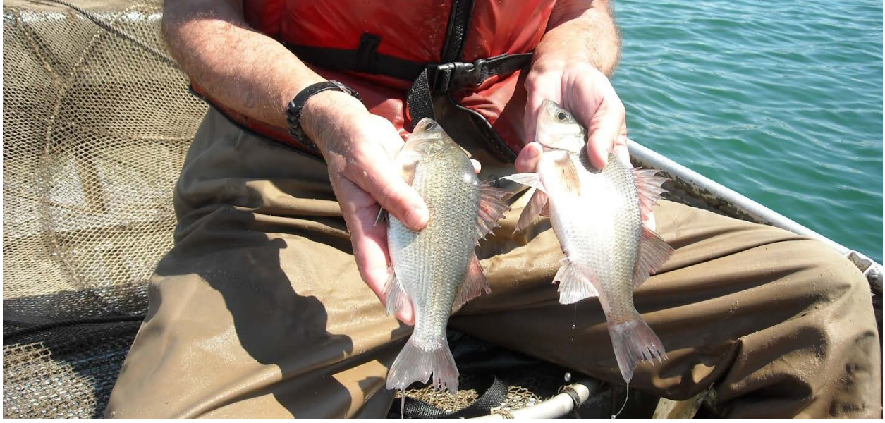
Two "common size" Lake Marburg White Perch

Area 6 Southeast Fisheries Management Area