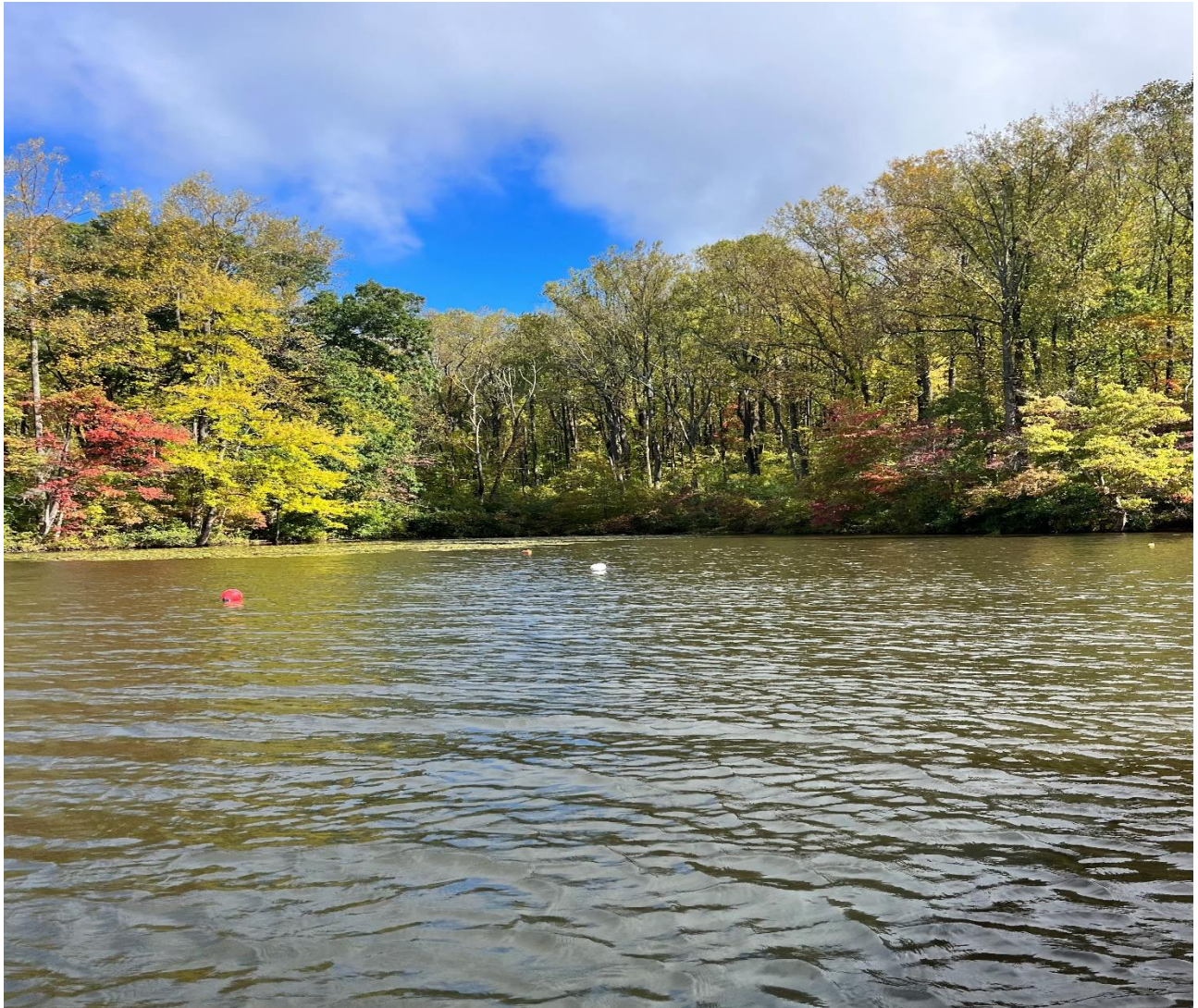
A view of a trap net set in Hopewell Lake during October 2023.

Hopewell Lake is a 68-acre impoundment located within the French Creek State Park complex in Berks County and is owned by the Pennsylvania Department of Conservation and Natural Resources. Its sister lake, Scotts Run Lake, is located upstream and also offers fantastic fishing opportunities, including stocked trout. Management of Hopewell Lake includes Big Bass regulations , which allows for the harvest of 4 Largemouth Bass \geq 15 in during the statewide open season for black bass. All other species are managed