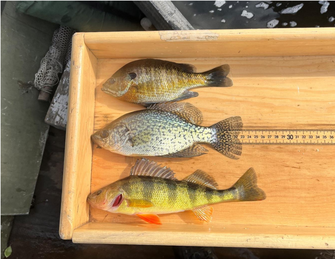
Figure 1: Bluegill (top), Black Crappie (middle), and Yellow Perch (bottom) typical of those collected during the trap net survey at Hopewell Lake in October 2023.

Based on survey results, Hopewell Lake continues to produce a good number of quality-length sunfish with a fair number reaching preferred length. Of the 209 Bluegills captured, 93% were quality length ( \geq 6 inches) while 26% were \geq 8 inches, which is the preferred length. The Black Crappie population also appears to be adequate, as a substantial number of fish (93%) were \geq 8 inches (quality length); however, only 3% of fish were of preferred length (10 inches). Finally, while not encountered in high abundance, a few preferred-length Yellow Perch ( \geq 10 inches) were collected. Other species encountered but at lower numbers were Brown and Yellow bullheads, Chain Pickerel, and Pumpkinseeds.