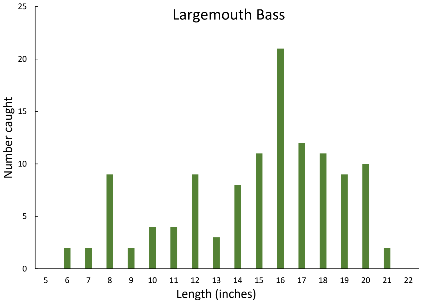
Figure 1. Length frequency distribution of Largemouth Bass collected at Lake Nockamixon during June 2021.

Lake Nockamixon has been surveyed numerous times in the past decade, primarily focusing on updating the PFBC’s Muskellunge and Walleye Management Plans. However, these species-specific surveys were conducted using trap nets during times of year when a representative sample of the bass population could not be collected. Therefore, a nighttime boat electrofishing survey was conducted during spring to evaluate the Largemouth Bass population. Biologists randomly selected 12 shoreline transects (300 – 400 yds long) to ensure that all available habitats could be sampled. Each site was sampled for 10 minutes, totaling two hours of effort across two nights. Totals of 117 Largemouth Bass and 2 Smallmouth Bass were collected during this survey. Largemouth Bass ranged from 6 to 21.75 in (Figure 1). The two Smallmouth Bass were 6 and 12 in, respectively.