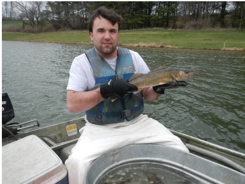
-The only Walleye captured during the 2015 survey was a 20" fish.

Saugeye stocking was discontinued at Dunlap Creek Lake in favor of Walleye management, as Saugeye fingerlings became impossible to acquire due to disease issues. Unfortunately, there appears to be poor survival of walleye fingerlings at Dunlap Creek Lake and a directed fishery has not developed. Only one walleye was captured in trap nets in 2015. Thus Walleye fingerling stocking will be discontinued at Dunlap Creek Lake.