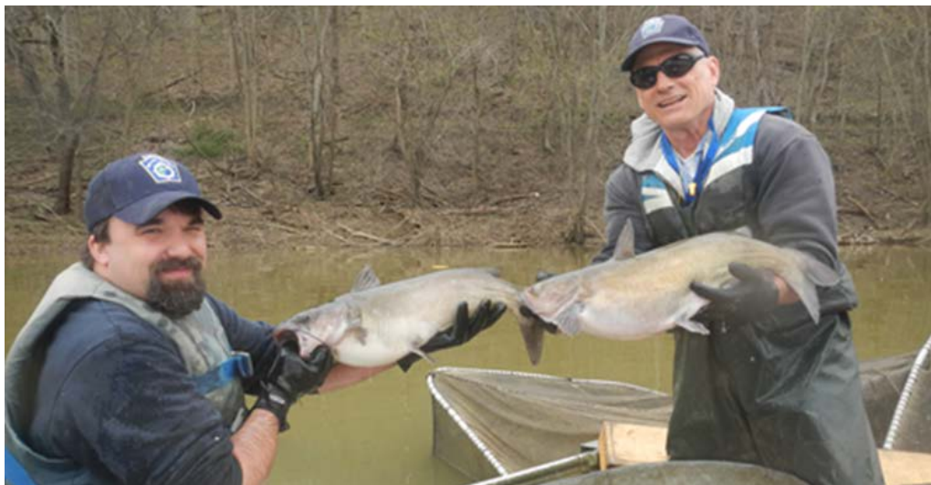
Two-foot Channel Catfish were rather common during our 2018 trap net survey