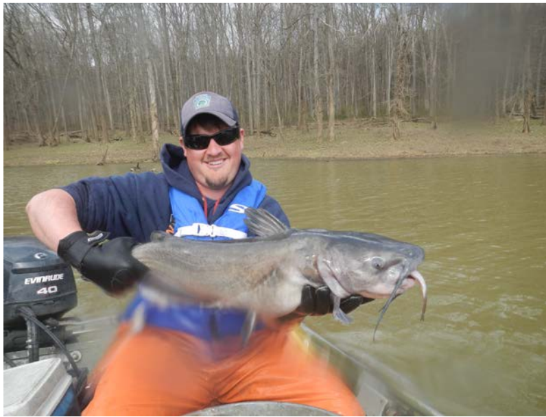
31-inch, 15 lb. Channel Catfish that was enjoying an easy meal of shad in our trap net

The highlight of the fishery at Loyalhanna Lake continues to be the catfish fishery. Channel Catfish and White Catfish, and to a lesser extent Brown Bullhead, continue to provide good fishing opportunities at this impoundment. Particularly impressive was the Channel Catfish population. Fish were well distributed throughout the size range (7 – 31 inches) with ample opportunities for anglers to catch some trophy sized catfish. Our largest fish went over 31 inches and weighed over 15 pounds. Most of our nets had at least one or two Channel Catfish over 25 inches. The White Catfish population also provides anglers with ample opportunities to catch catfish in the 14 – 17-inch size range, with a few trophies reaching around 20 inches. Anglers are reminded that White Catfish are non-native to the Ohio River basin and are discouraged from moving them to other water bodies. White Catfish can be distinguished from Channel Catfish by their moderately forked, rounded caudal (tail) fin lobes, head that is generally wider than the body, and number of anal fin rays (19-23). Channel Catfish also have forked tails but generally have more pointed caudal fin lobes, a narrower head, and a higher number of anal fin rays (24+). Other catfish species in Loyalhanna Lake that may be confused with White Catfish include Brown Bullhead and Yellow Bullhead; however, both of these have caudal fins with little to no fork.