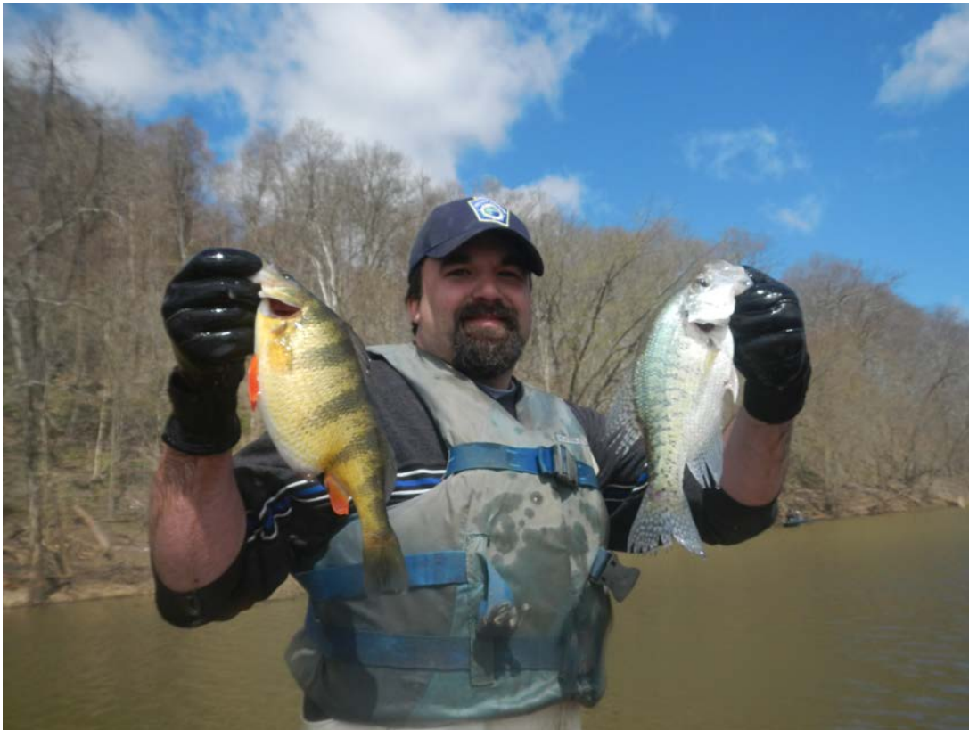
A big Yellow Perch and nice White Crappie from trap netting at Loyalhanna Lake in 2018

Sixteen trap nets were fished the week of April 23 rd and a total of one Tiger Muskellunge was captured. As part of the statewide Musky study, all Muskellunge and Tiger Muskellunge that had been previously captured were tagged with a Passive Integrated Transponder (PIT) tag that allowed us to identify re-captures, assess survival, and track the fish's growth rate over time. The lone Tiger Muskellunge re-captured in 2018 was 38 inches long and weighed 14.5 pounds; no Muskellunge were captured. The Tiger Muskellunge was originally captured in 2014 at 35 inches and 10 pounds and was recaptured in 2016 at 37 inches and 11.5 pounds. Unfortunately, as this was the only Muskellunge or Tiger Muskellunge captured in 2018, which indicates survival of these species is well below expectation, we will be discontinuing stocking of these species at Loyalhanna Lake.