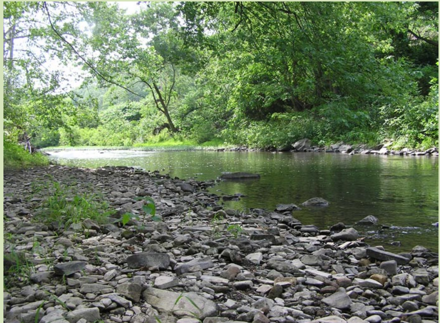
Tuscarora Creek, Jeremy Deeds, Western PA Conservancy

The Fish and Boat Commission has taken a 3-fold approach to addressing the aquatic resource needs. First, using a landscape-scale approach we have developed a series of SWG-funded projects on major ecological systems such as the Allegheny, Susquehanna, and Delaware Rivers, to establish comprehensive baseline data that has previously been lacking. Second, we have targeted data collection and management initiatives for indicator or keystone species, guilds or communities, such as the eastern massasauga, or groups of amphibians and reptiles.