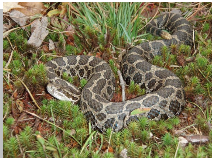
Eastern Massasauga, Ryan Miller, Western PA Conservancy

A strategic plan for protecting the critical habitat for the four remaining populations of eastern massasauga in Pennsylvania was completed and delivered to PFBC. This plan identifies and prioritizes the most critical properties for eastern massasauga conservation efforts, providing a guide for government and conservation groups to effectively protect this species. Matt Kowalski, Western PA Conservancy; T-53, Eastern Massasauga Rattlesnake Habitat Protection Plan.