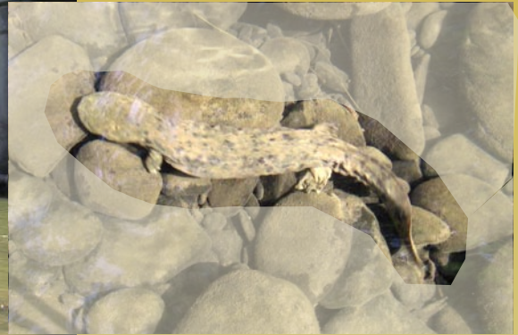
Eastern Hellbender