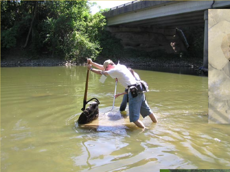
Searching for Eastern Hellbenders

Advancing Understanding and Conservation of Pennsylvania's Diverse Natural Heritage