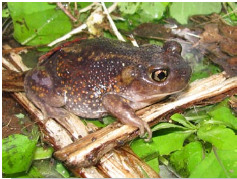
Eastern Spadefoot, Pennsylvania, Brandon M. Ruhe

The life-history of the eastern spadefoot toad contributes to a general lack of information on its distribution and abundance in Pennsylvania. This project will determine the location of eastern spadefoot toad metapopulations and breeding sites by assessing the current geographic distribution throughout Pennsylvania. The results of this project will serve the overall purpose of helping to create a successful comprehensive conservation and management plan for maintaining viable populations of the eastern spadefoot toad as well as