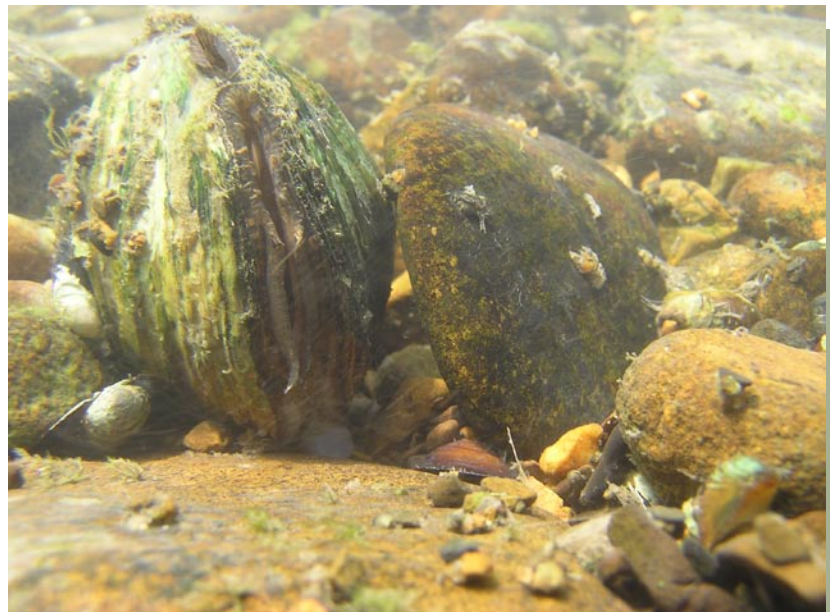
Freshwater Mussels

Freshwater mussels are among the most imperiled group of organisms in North America. These animals are long-lived and thus serve a valuable role in understanding water quality and other factors influencing their survival. Water quality, water quantity, pollution and other