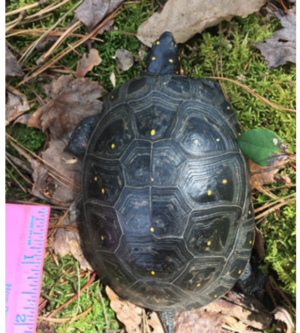
Figure 5. Spotted Turtle.

In 2021, a status assessment and conservation plan development concluded for an expansive (i.e., Maine to Florida) Spotted Turtle project (Figure 5). Find out more at Conservation for Northeast Turtles: https://www.northeastturtles.org/