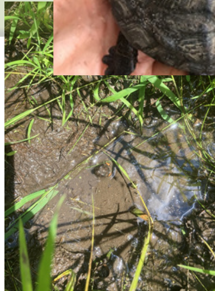
Figure 3 (left). Bog Turtles are dependent on groundwater-fed wetlands with soft, mucky soils for burrowing.