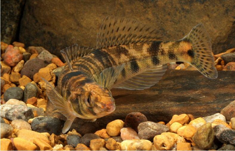
Figure 1. Chesapeake Logperch ( Percina bimaculata ) is a Pennsylvania fish Species of Greatest Conservation Need.

State Wildlife Action Plans are pro-active guidance for protecting and recovering imperiled and declining species. The 2015-2025 Pennsylvania Wildlife Action Plan (PA WAP) accomplishes this by identifying species (i.e., Species of Greatest Conservation Need) such as the Chesapeake Logperch ( Percina bimaculata ) (Figure 1), their habitats, threats, and importantly, conservation actions for their protection and recovery. The PA WAP also includes information about monitoring, partner and public involvement, and plan maintenance and revision. The 664 species in the plan include: birds, mammals, fishes, amphibians, reptiles, freshwater mussels, and other aquatic and terrestrial invertebrates. With these extensive taxonomies, the Pennsylvania Game Commission and Pennsylvania Fish & Boat Commission jointly administer the plan on behalf of all Pennsylvanians who care about Species of Greatest Conservation Need (SGCN) and their habitats.