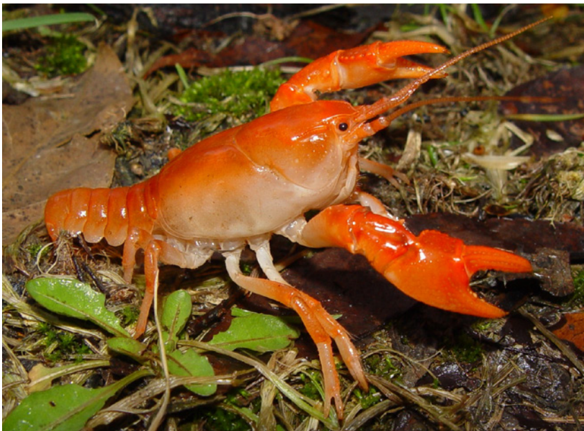
Figure 11. Upland Burrowing Crayfish.

From 2017 to 2020, >1,500 sites were sampled for crayfishes in the Ohio River, Potomac River, Genesee River, and Lake Erie Basins. This sampling resulted in collection of >9000 crayfish from 14 species (includes 3 non-native species). The Rock Crayfish ( Cambarus carinirostris ) was the most widespread and dominant species in western Pennsylvania and in headwater (i.e., smaller) streams. In the Ohio River drainage, the Allegheny Crayfish ( Faxonius obscurus ) was found in most named, wadable streams. This species is tolerant of pollution and was even collected within the Pittsburgh city limits but was not generally found in headwater streams. The Digger Crayfish ( Creaserinus fodiens ) was collected from Pennsylvania for the first time and a potentially undescribed species was discovered in the Lake Erie basin. In anthropogenically modified landscapes green spaces, including parks and state game lands, were important refugia for crayfishes (especially burrowing species).