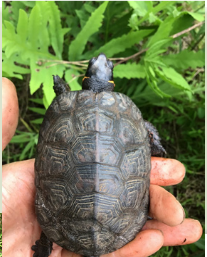
Figure 2 (above). Bog Turtle.

In 2021, the PFBC and partners were actively engaged in several Competitive State Wildlife Grants projects directed at region-wide turtle conservation. This article is a snapshot of projects supporting the conservation and recovery of these species.