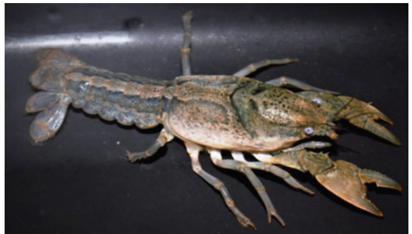
Figure 9. Digger Crayfish.