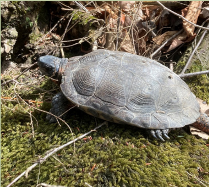
Figure 6. Wood Turtle.

A 2021-2023 project is implementing key components of the Wood Turtle Conservation Plan developed through a 2014 Competitive State Wildlife Grant. The current grant addresses a wide range of important Wood Turtle conservation needs (Figure 6, Table 2). Through regional Wood Turtle assessment and conservation efforts numerous peer-reviewed articles, as well as a comprehensive book (Jones and Willey, 2021), have been published. (See highlight on next page).