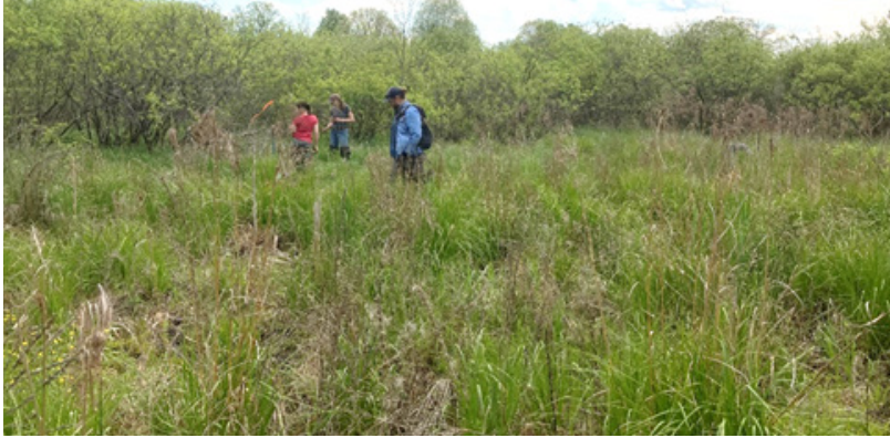
Figure 4. Teams of experienced Bog Turtle surveyors explore wetland habitats.

In the turtle surveying “off-season”, the project team will shift their focus to monitoring and maintaining Bog Turtle habitat. Favored by Bog Turtles, open emergent wetlands (Figure 4) are vulnerable to succession by woody and invasive plant species. Biologists have developed plans to manage priority sites and are implementing these conservation actions in the winter of 2021-22. Project funding continues through 2025.