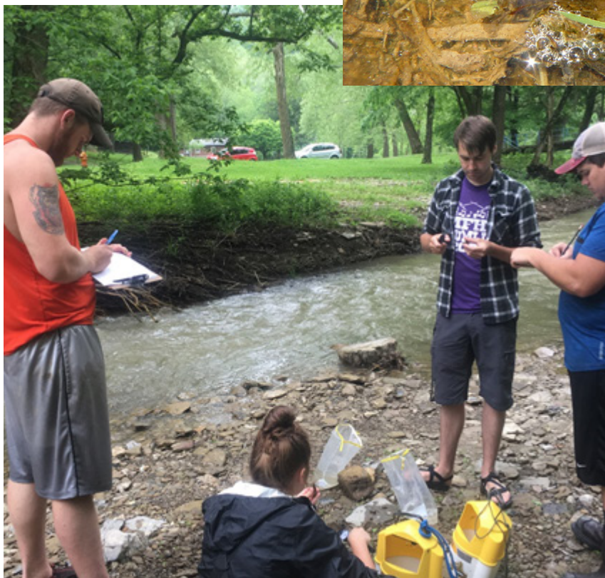
Figure 12 (top). Little Brown Mudbug.