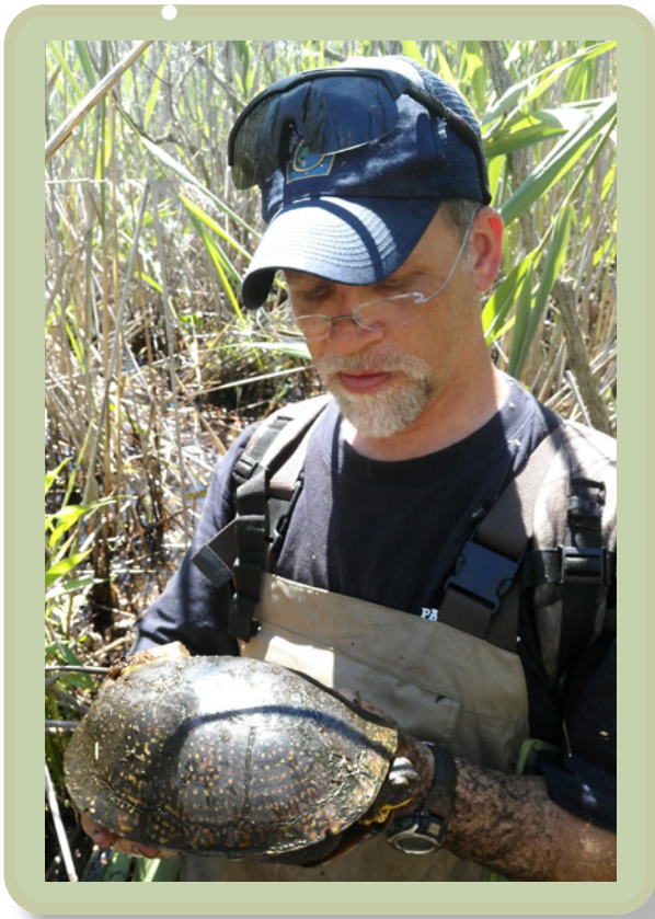
Figure 7. Inspecting a tagged Blanding's Turtle.