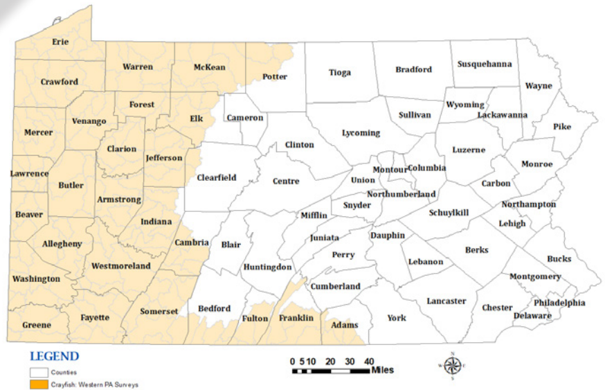
Figure 10. Map of area sampled (shaded) for the Western Pennsylvania Crayfish Inventory and Conservation Assessment project.

All major western Pennsylvania watersheds including the Erie, Genesee, Ohio, and Potomac River drainages were comprehensively surveyed for crayfishes (Figure 10). Historic sites (mostly from Ortmann 1906) were surveyed where possible, with new sample locations selected semi-randomly, and determined through Geographic Information Systems (GIS), available landowner permission, and remote ground-truthing. Stream-dwelling crayfish were captured using seines, dip nets and hand collections during baseflow conditions. Burrowing crayfish were collected via excavation, baited lines and nocturnal visual encounter surveys.