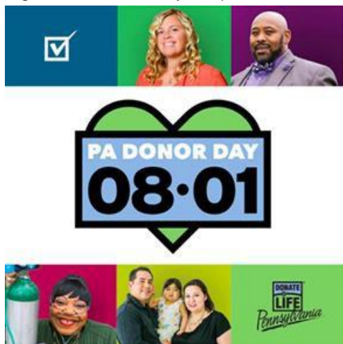
Figure #5: Donor Day Graphic