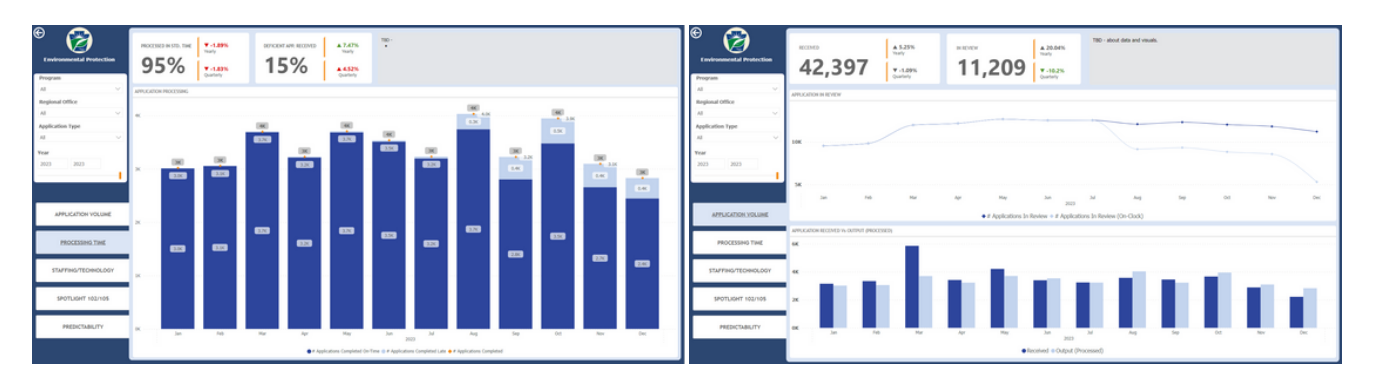
Two screenshots highlighting data from the Business Friendly Dashboard

Business Friendly Dashboard – To provide a more real-time assessment of the operational performance of agencies core to economic development activity in the Commonwealth, OTO has designed and built out a Business Friendly Dashboard for the Governor's Office to highlight key performance indicators. The Office collaborated with DEP to develop an initial proof of concept, established data sharing infrastructure between agency databases and a centralized OTO datalake, and will continue to refine the analytics and insight capability of the dashboard to enhance agency performance and support resource allocation decisions.