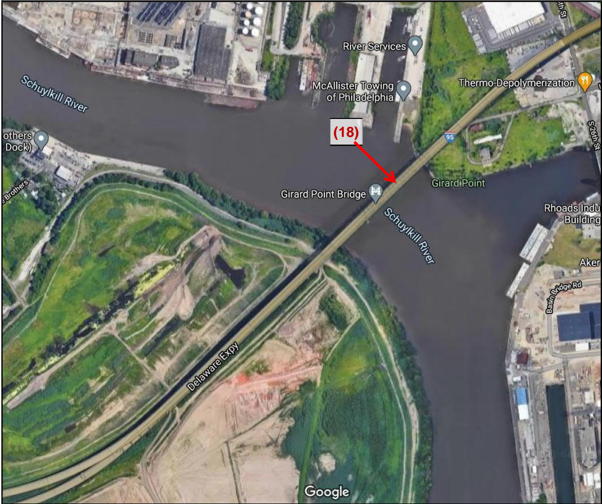
Location of Bridge 18 (Main Girard Point Bridge)