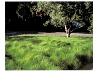
NO MOW GRASS