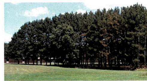
DENSE EVERGREEN PLANTING