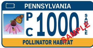
Plate Colors - Blue, white and yellow

You can own a vehicle registration plate that helps support The Pennsylvania Pollinator Habitat Plan. Historically, agriculture has been, and continues to be important to the Pennsylvania economy. Habitat loss, fragmentation and degradation, increased pesticide use and introduced diseases threaten the pollinators on which we depend for food crops and a sustainable agricultural economy. In fact the declining numbers of several species have been so significant that these species are under review for listing as federal threatened and endangered species, including the migratory Monarch Butterfly. PennDOT's Pollinator Habitat Plan will, in partnership with other federal and state agencies, private and community organizations, create naturalized gardens and meadows planted with pollinator-friendly plant species at designated sites. Sites within rest areas and welcome centers will provide additional public education benefit.