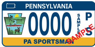
Plate Colors - Blue, white and yellow

You can own a vehicle registration plate that helps support The Pennsylvania Game Commission and the Pennsylvania Fish and Boat Commission conduct activities that promote youth hunting and fishing education.