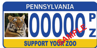
Plate Colors - Blue, white and yellow

You can own a vehicle registration plate that helps save endangered wildlife and lets you show your support for zoos wherever you drive. Created by the Zoological Council, this registration plate pictures one of the most magnificent and endangered animals in the world - the Siberian Tiger. The Pennsylvania Zoological Council is comprised of six institutions: The Philadelphia Zoo; the Pittsburgh Zoo; the Erie Zoo; the National Aviary in Pittsburgh; the Elmwood Park Zoo in Norristown; and the Lehigh Valley Zoo. Each institution is devoted to animal conservation and education programs. Proceeds from the sale of the registration plates will directly support these groups and their important projects, which include captive breeding of endangered species; creating bird sanctuaries on recovered wetlands; providing community education programs; constructing exciting interactive exhibits, and reintroducing endangered species into the wild. Purchase the zoo registration plate, and you immediately add your support to the efforts of the Pennsylvania Zoological Council. You'll also show others your love for wild animals.