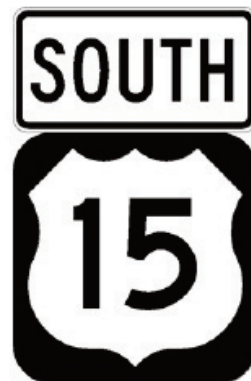
South Bound S.R. 15