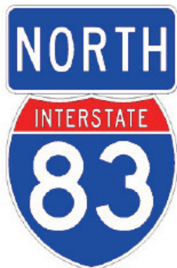
North Bound S.R. 83