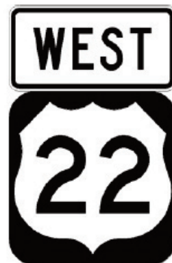
West Bound S.R. 22