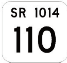
State Route 1014 Segment 110 Marker