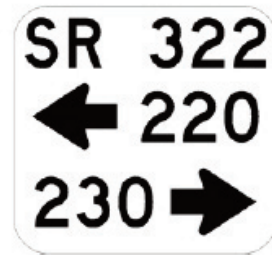
Intersection Marker State Route 322 Left Segment 220 Segment 230 Right