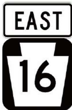
East Bound S.R. 16