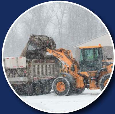
Middle photo courtesy of The Herald-Standard, Uniontown, PA