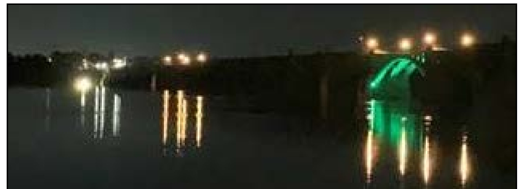
Video cameras were used to collect data on mayfly swarms throughout the evening