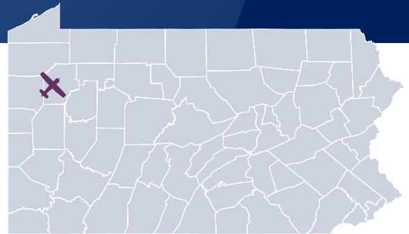
This airport is classified as a Advanced Airport in Pennsylvania's State Aviation System Plan and is eligible to receive federal funding from the FAA.

Venango Regional Airport (FKL) is a general aviation airport located two miles southwest of Franklin and approximately 10 miles southwest of Oil City. Situated in the northwestern corner of Pennsylvania, the county occupies an area of the state known for its natural beauty, wonderful small towns, and fascinating history. Nearby attractions and events include the Venango Museum of Science and Industry, the Debenice Music Museum, and the annual Applefest, to which the airport provides a shuttle. The airport is also home to the Vintage Wings and Military Museum, which draws in numerous visitors. The airport primarily supports recreational activity. However, the airport also provides access for executive flights and hosts its Wings and Wheels event every August, which draws in hundreds of members from the local community, as well as visitors. Additional aviation activity supported by the airport includes aerial inspection, air ambulance activity, flight testing, and flight training and instruction.