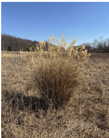
Miscanthus , easy to ID during the dormant season, taking over a field at Middle Creek off of Rt. 897.

To manage autumn olive, fire is often used to make them more accessible. Once other vegetation is topkilled (meaning above ground vegetation is dead or burned away from the fire), autumn olive is easier to reach, and we will cut them back and treat with herbicide. Other options are using mowing that handles larger vegetation. Ultimately, herbicide is a necessary tool, otherwise the shrubs grow back with a vengeance! Left totally unchecked, they can take over entire fields. Autumn olive fixes atmospheric nitrogen and increases the levels of nitrogen in the soil, which can actually throw off the soil chemistry to the detriment of other native species. Some, if left unchecked, can grow up to 10 feet tall.