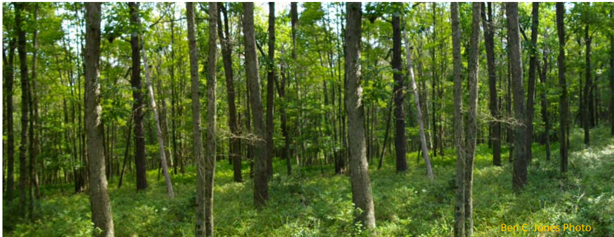
Mixed oak stand with remnant pitch pine, scrub oak, and blueberry. The stand could be cut heavily to convert to barrens, or thinned to convert to a savanna or woodland. Either way, prescribed fire will be part of the plan.

Where barrens have progressed to forest, tree cutting is necessary. Commercial operations are preferred because harvested trees are removed from the site, aiding in fuel reduction. Early successional structure can be restored with residual basal area up to 10 ft 2 (10-15 trees/acre) in oak and hard pines. Greater residual basal area will result in savanna or woodland habitats that are also valuable parts of the barrens complex.