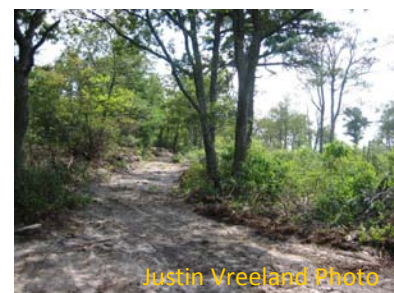
Dozed firebreak around the perimeter of a large barrens complex.

Managers should identify and take advantage of existing firebreaks where possible. Features like streams, wetlands, existing roads, and trails can be excellent anchor