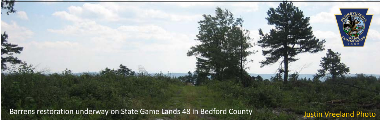
Barrens restoration underway on State Game Lands 48 in Bedford County