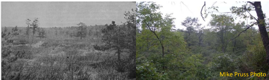
Scotia Barrens in the 1940s and today. Locomotive-ignited fires prior to the mid-1920's maintained ideal scrub oak pitch pine habitat. Today, the barrens is dominated by maturing forest and exotic shrubs. The Game Commission is in the restoration phase of managing this 1,000+ acre barrens.

Detailed descriptions including condition, threats, and management needs for PA barrens.