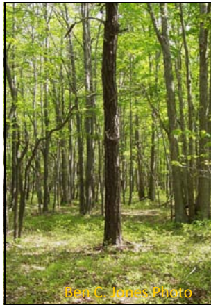
Relict pitch pine in mixed hardwoods.

The first step in habitat conservation is determining where important habitats could occur. Ridgetop barrens are found in the Northern Ridge and Valley, Allegheny Plateau, Pocono Plateau, Northern Great Valley, and Allegheny Deep Valley Ecoregions of Pennsylvania. The area encompasses 132 State Game Land tracts.