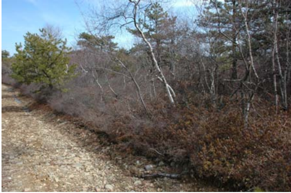
Mowing near firebreaks lowers fuel loads, improving safety of prescribed burn operations.

The first step in restoration may include mechanical treatment with a large rotary or mulching head machine. This is helpful in knocking down tall vegetation (i.e., fuel) near firebreaks. The lower the height of adjacent fuels, the narrower firebreaks can be, thus minimizing soil