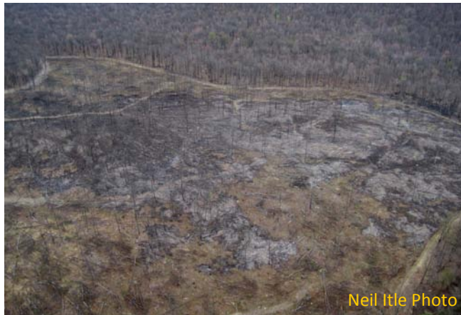
Fire behavior is influenced by natural features, creating diverse habitats. Note the interspersion of burned and unburned areas and the existing roads that served as perimeter firebreaks.

points. From there, dozer lines can fill the gaps and secure large areas for burning operations. Because of soil conditions and cost, dozer lines should only be used to supplement natural breaks.