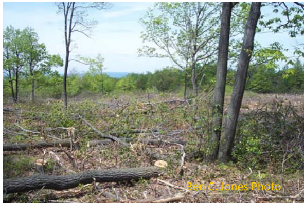
Hand felled trees and mowed scrub oak and laurel awaiting prescribed fire.

Felling trees and leaving them lay may be an option where commercial sales are not viable. Heavy fuel loading from down trees is a concern. Keep in mind that returning a fire regimen will cause some tree mortality, the extent depending on fire frequency and intensity; therefore, some areas can be thinned with fire alone. Regardless of mowing or cutting treatments, it will be necessary to use prescribed fire during restoration.