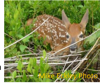
Fawn in barrens blueberry patch.