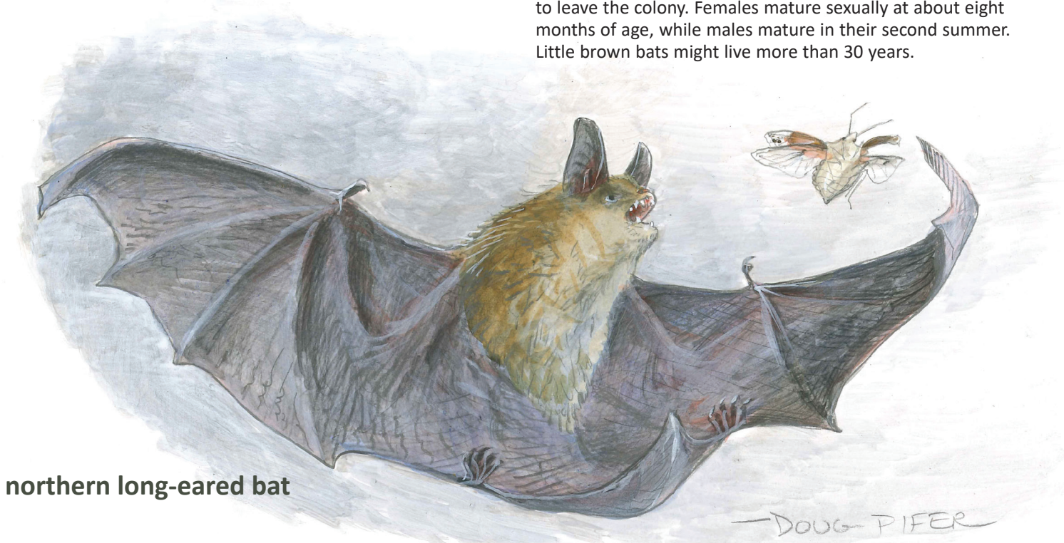
northern long-eared bat

A single young is born to each female in June or early July. After four weeks, the young bat is fully grown, and ready to leave the colony. Females mature sexually at about eight months of age, while males mature in their second summer. Little brown bats might live more than 30 years.