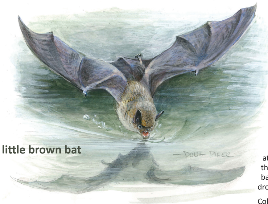
little brown bat

None of Pennsylvania's bats routinely fly during the brighter hours of daylight, preferring to make their feeding flights in late afternoon, evening and early morning. However, it's not unusual to see a bat flying during the day. Roost disturbance and heat stress might cause bats to take wing during daylight hours. During the day, they roost singly, in pairs, in small groups, or in large concentrations, depending on the species. They seek out dark, secluded spots such as caves, hollow trees and rock crevices. They may also congregate in vacant buildings, barns, church steeples and attics; some hide among the leaves of trees. They hang upside down, by their feet when roosting.