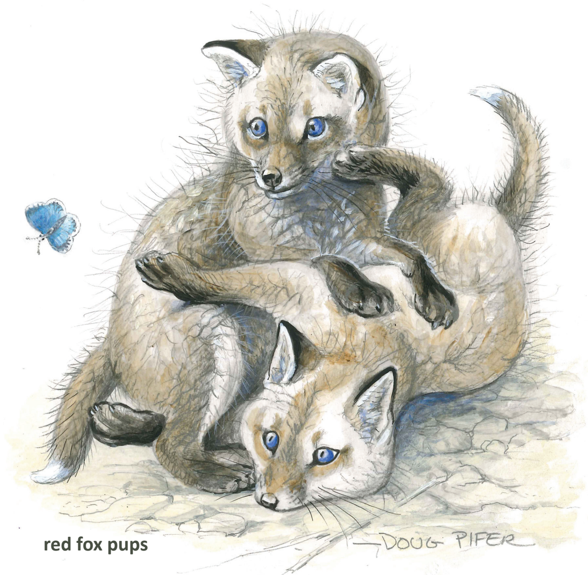
red fox pups

More and more people are accepting predators as valuable members of our natural world. Foxes are no exception. Their presence in Pennsylvania provides recreation and wildlife diversity, two important facets of any wildlife management program.