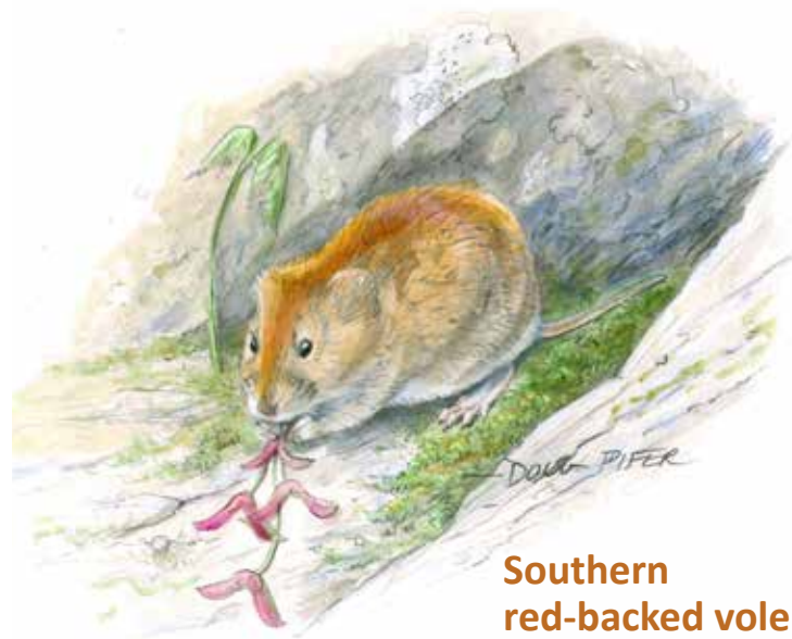
Southern red-backed vole

Rock vole ( Microtus chrotorrhinus ) —This species of New England and Canada inhabits a limited area of northeastern Pennsylvania. It closely resembles the more common meadow vole, except that the rock vole has a yellowish orange nose. The rock vole inhabits forests. In Pennsylvania it lives in cool,