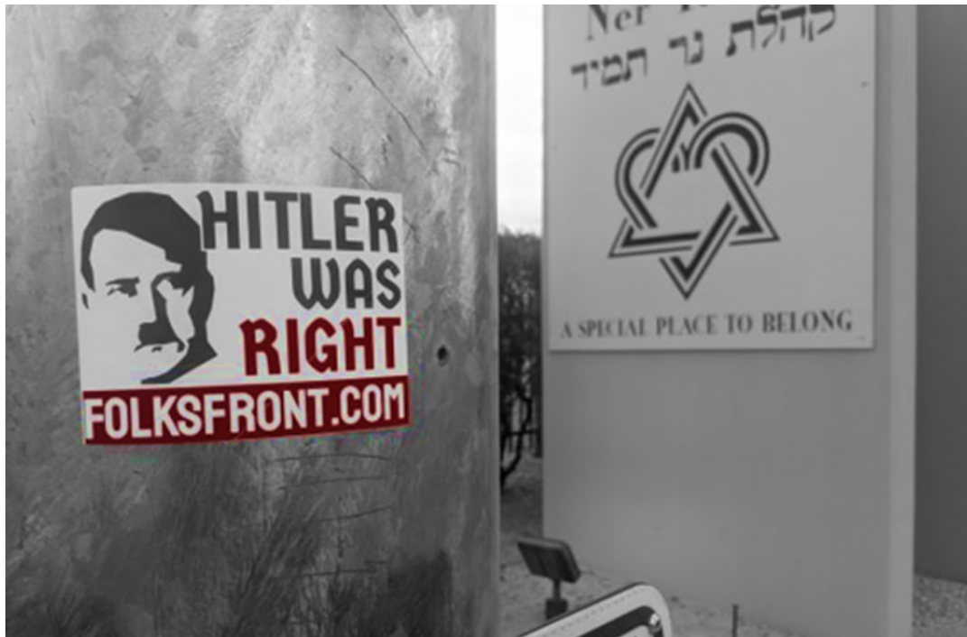
Antisemitic propaganda placed outside a synagogue – Nevada April 2021

December 2021: Patriot Front propaganda was found at the Jewish Community Center in Rockville, Maryland.