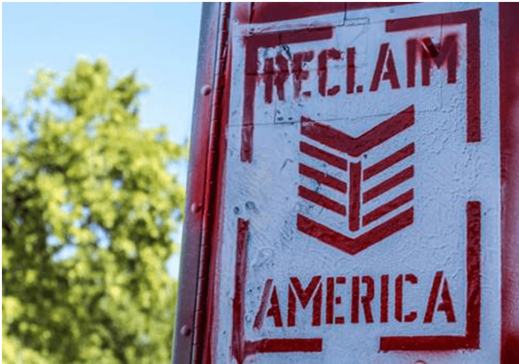
Patriot Front stenciled graffiti – Texas September 2021

Massachusetts, Texas and Maryland, and members were responsible for 190 of the 232 (or 82 percent) of distributions on college campuses, as well as the majority (or 94 percent) of white supremacist stenciled graffiti.