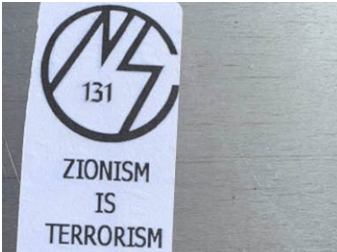
Antisemitic sticker from NSC - Rhode Island 2021