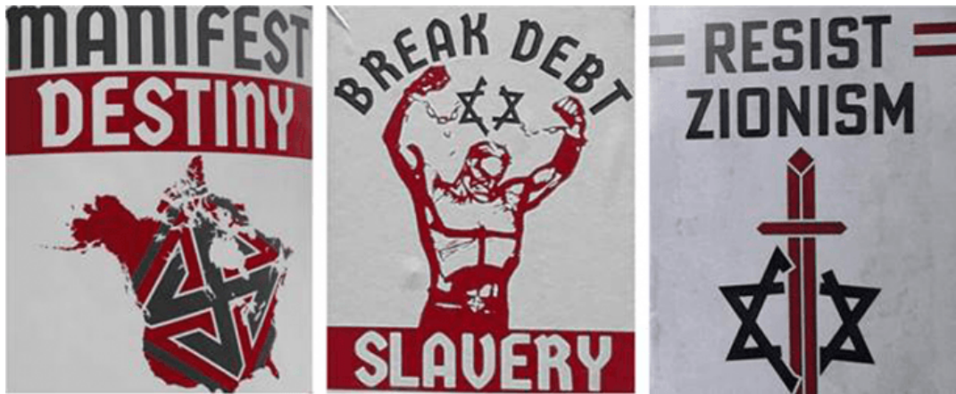
Samples of FRM propaganda – Georgia, Florida, and Minnesota 2021

Propaganda incidents from the neo-Nazi Nationalist Social Club (NSC) decreased to 48 in 2021, dropping 53 percent from 102 distributions in 2020. The group's propaganda is explicitly white supremacist and often presents its membership as a "white defense force" with territorial claims to New England. Some of its 2021 propaganda read: "New England Nationalism = Keep New England white," "Jews rape kids," "White defense force," "Black lives murder white children" and "Jews killed Jesus."