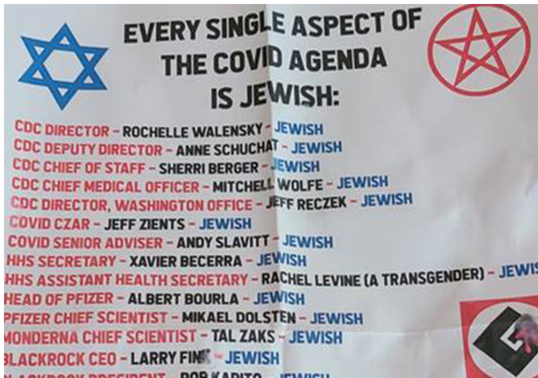
Antisemitic GDL propaganda – Texas 2021