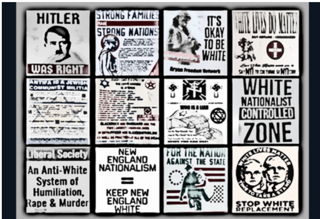
Sampling of 2021 white supremacist propaganda

ADL's annual assessment found white supremacist events more than doubled year-over-year