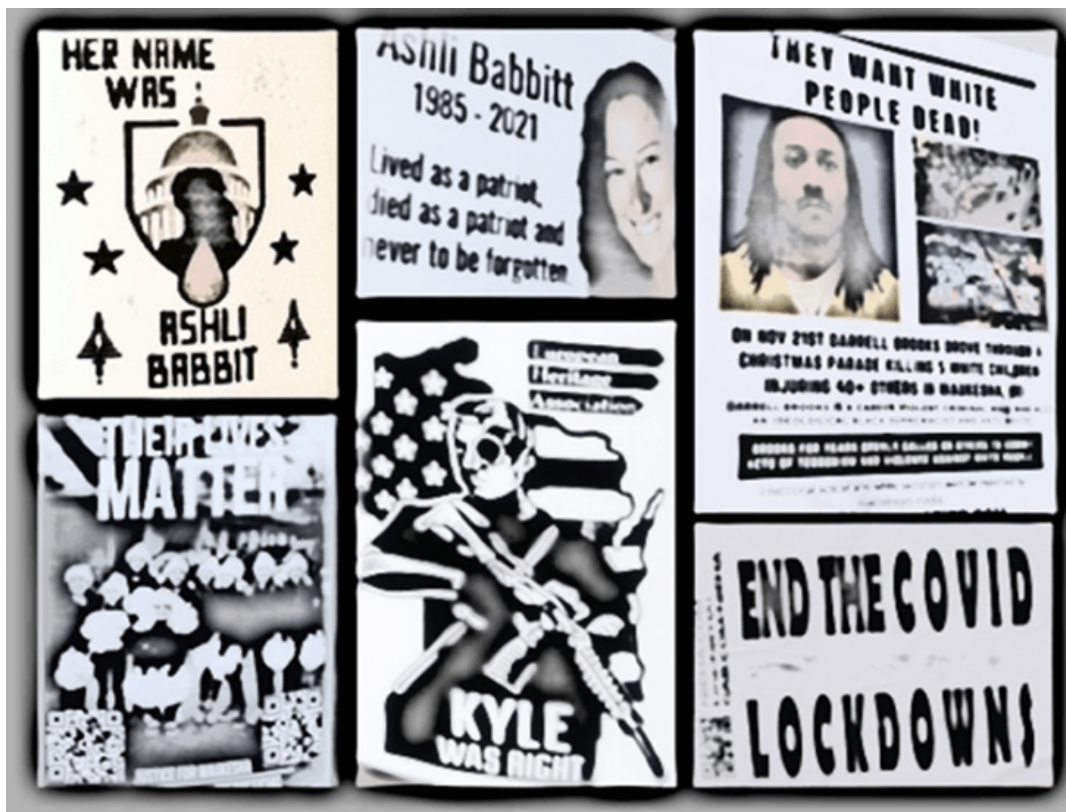
Sampling of white supremacist propaganda focused on current events