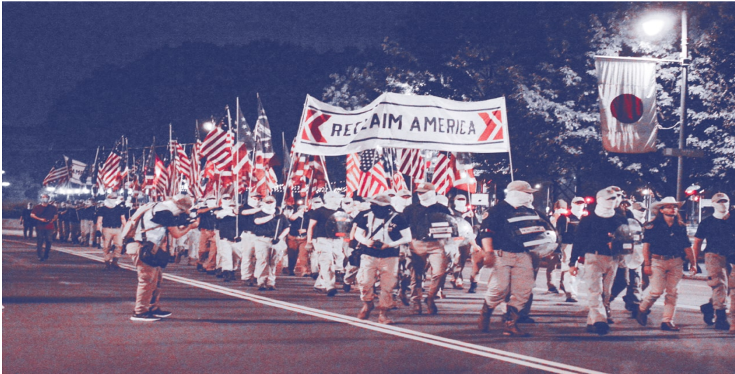
Patriot Front demonstration – Pennsylvania July 2021

NSC held the most (21) flash demonstrations. Often directly protesting their perceived enemies, NSC's 2021 events included a demonstration in front of the Holocaust Memorial in Boston, a protest of critical race theory outside a school board meeting in New Hampshire, a protest outside a progressive bookstore in Massachusetts, and an anti-LGBTQ protest outside the Seacoast Repertory Theatre in New Hampshire.