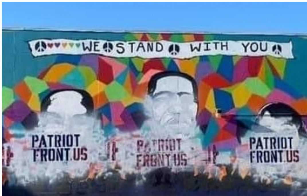
Patriot Front stenciling over BLM mural – Oregon July 2021

New Jersey European Heritage Association was responsible for 219 propaganda incidents in 2021, roughly five percent of the total propaganda activity nationwide, a 57 percent drop-off from their 2020 efforts. In 2021, its propaganda was recorded in 28 states but most frequently reported in New Jersey, Pennsylvania, New York and Florida.