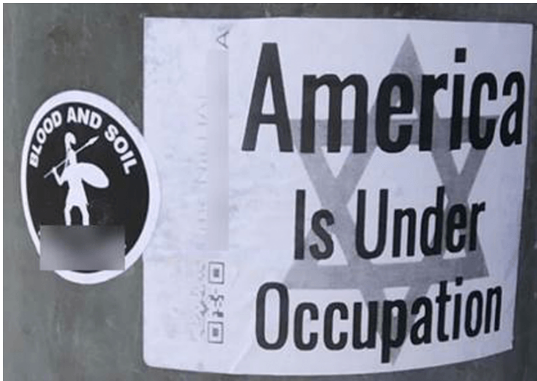
Antisemitic propaganda from NJEHA – New York May 2021

Folkish Resistance Movement (FRM) was responsible for the third highest number of propaganda incidents in 2021 and 50 percent of antisemitic propaganda incidents in 2021. The group's propaganda was recorded in 19 states but was found most frequently in Minnesota, Mississippi, Arizona, Colorado and Texas.